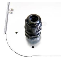
RJ45 passthru Ethernet Feedthru