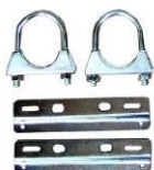
ENC-DC Die Cast Enclosure