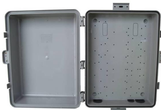
ENC-PL Polycarbonate Enclosure