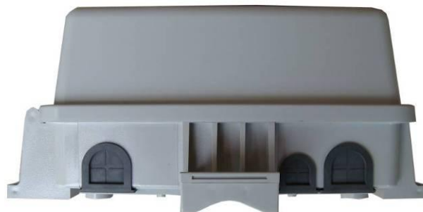
ENC-PL Bottom Panel with Universal Feedthru