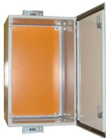
ENC-ST Steel Enclosure with Pole Mount Kit