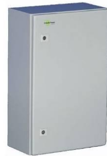
ENC-ST Steel Enclosure