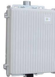
ENC-DC Die Cast Enclosure