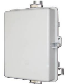
ENC-PL Polycarbonate Enclosure