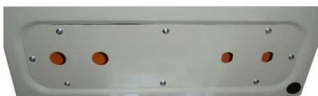
ENC-ST Bottom Panel Cutouts