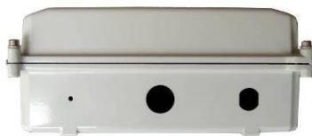
ENC-DC Bottom Panel Cutouts

Features include a hinged cover for easy access and weatherproof feedthru's for cables and wiring. The ENC-DC comes with an RJ45 feedthru which allows passing of an RJ45 connector to make the entire enclosure field replaceable. It also has a cutout for an N Female connector for attaching external antennas. The ENC-PL has 3 weatherproof universal cable feedthru's. The ENC-ST has two cutouts for RJ45 Feedthru and two for N female connectors. The ENC-St also comes with a removable battery shelf.