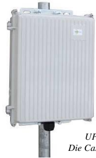
UPSPro™ Die Cast Enclosure