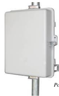
UPSPro™ Polycarbonate Enclosure