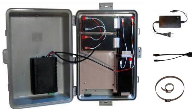
UPSPro™ Polycarbonate Enclosure System