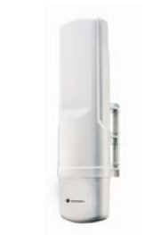
CSM 430 Subscriber Module

Motorola Wireless Broadband products combine field-proven toughness with exceptional performance, security, ease-of-use and cost effectiveness. PMP 430 Series Access Point and Subscriber Modules are available with total throughputs up to 40 Mbps for data, video and voice applications. PMP 430 Subscriber Modules can be purchased with throughputs of 4, 10, 20 or 40 Mbps and throughput can be enhanced to existing modules via a fixed software license.