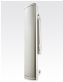
CAP 430 Access Point

The Motorola Wireless Broadband Point-to-Multipoint (PMP) 430 Access Point and Subscriber Module is the ideal solution for developing, enhancing and extending advanced broadband networks for data transfer, voice and video applications. The 430 Access Point and Subscriber Module provide wireless Line of Sight (LOS) and near Line of Sight (nLOS) broadband connectivity in the 5.4 GHz and 5.8 GHz spectrum.